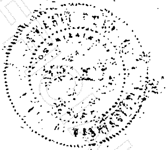
STEPHANIE WOOD, Clerk of the Board