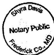
SHYRA DAVIS Notary Expires: 03/14/2012