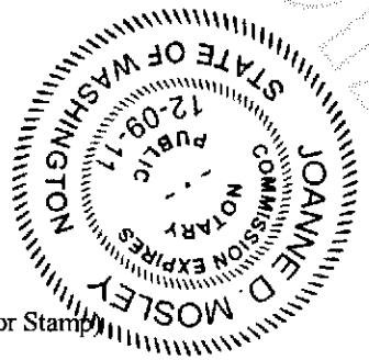
(Seal or Stamp)