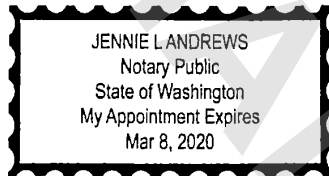
(Seal or stamp)

is the person who appeared before me, and said person acknowledged that he/she signed this instrument and acknowledged it to be his/her free and voluntary act for the uses and purposes mentioned in the instrument.