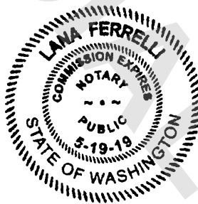
(Seal or stamp)

is the person who appeared before me, and said person acknowledged that he she signed this instrument and acknowledged it to be his/her free and voluntary act for the uses and purposes mentioned in the instrument.