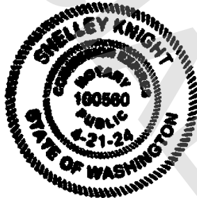
(Seal or stamp)

is the person who appeared before me, and said person acknowledged that he/she signed this instrument and acknowledged it to be his/her free and voluntary act for the uses and purposes mentioned in the instrument.