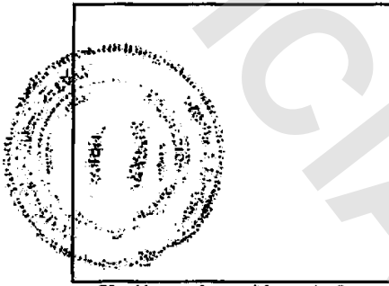
(Use this space for notarial stamp/seal)

Bradley A. Methner (Signature of Notary)