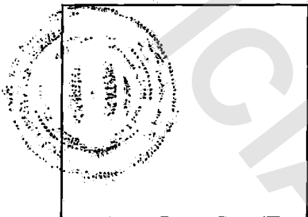
(Use this space for notarial stamp/seal)