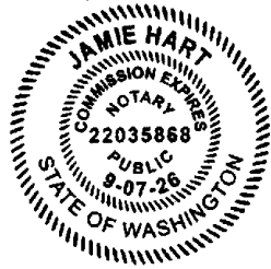
(Seal or stamp)

is the person who appeared before me, and said person acknowledged that he/she signed this instrument and acknowledged it to be his/her free and voluntary act for the uses and purposes mentioned in the instrument.