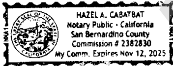
Place Notary Seal and/or Stamp Above

Signature Hazel A. Cabatbat Signature of Notary Public