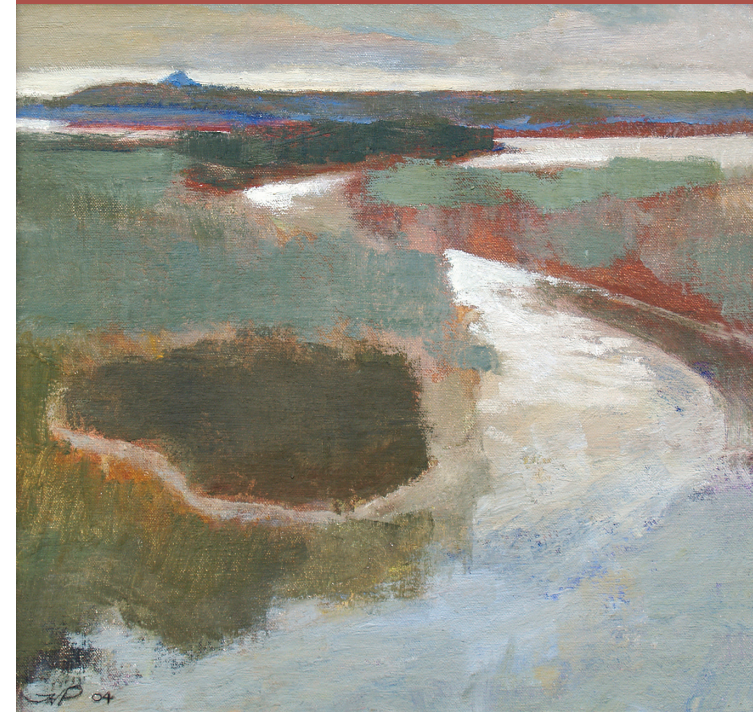
Skagit Icon © T.H. Pickett

SKAGIT COUNTY HISTORICAL MUSEUM presents