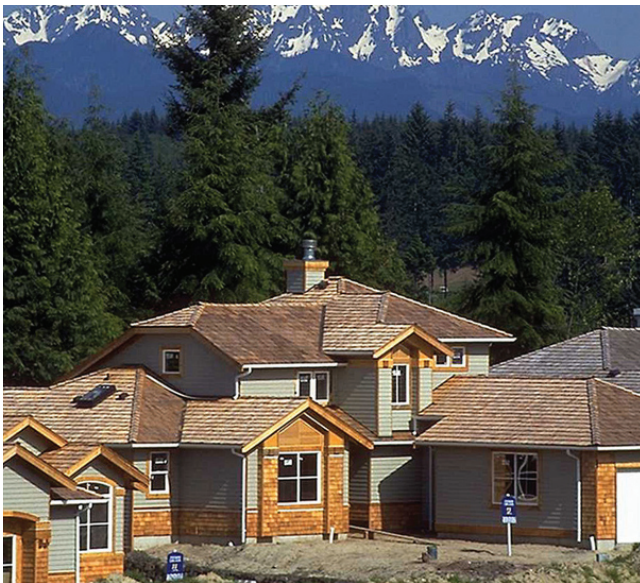
Figure 3 provides a view of the existing development in the Bayview Ridge Subarea.

The existing residential pattern within Bayview Ridge Subarea reflects a change in zoning over time in response to the development of County Plans and more recently, in response to GMA requirements. Although the eastern portion of the Subarea has always been considered residential (as opposed to industrial or agriculture), a mix of urban and rural residential development currently exists. The present zoning, Rural Reserve and Rural Intermediate reflects current GMA requirements regarding rural designations for properties outside an UGA. The existing Bayview Ridge residential subdivisions are zoned Rural Intermediate, and undeveloped and large-lot properties are zoned Rural Reserve. The area was downzoned to rural standards in 1998 in response to the GMA and a Western Washington Growth Management Hearings Board compliance order. Urban development was not allowed outside UGAs and this area was not designated as such. The Bayview Ridge Subarea Plan establishes a UGA at Bayview Ridge that acknowledges and makes the most of the existing urban infrastructure and residential development at urban densities.