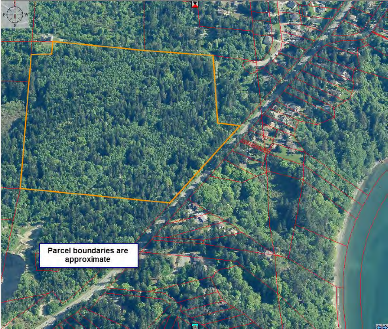
The body of water on the right-hand side of the above image is Burrows Bay. The main road running through the image is Rosario Road. The Wooding parcel is outlined with the orange line.