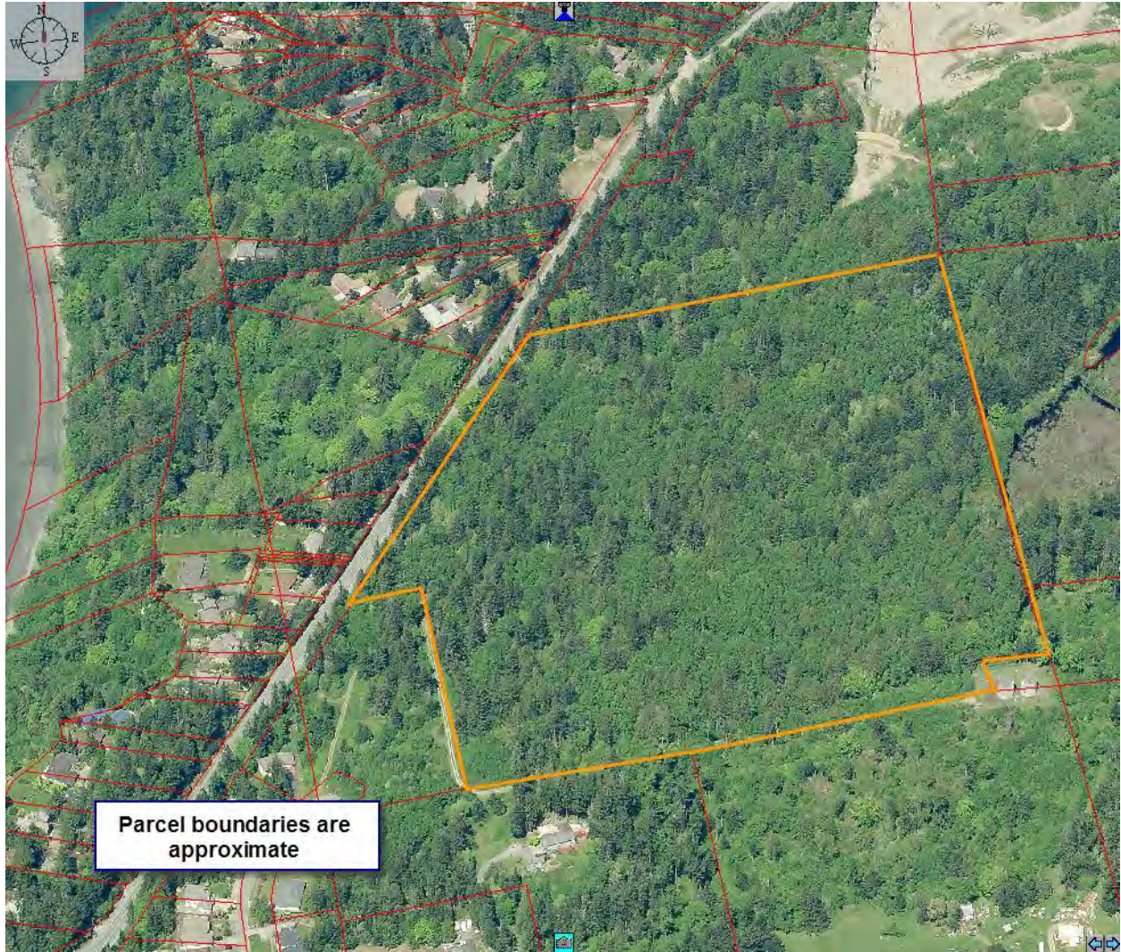
The body of water just visible on the left-hand side of the above image is Burrows Bay. The main road running through the image is Rosario Road. The Wooding parcel is outlined with the orange line.