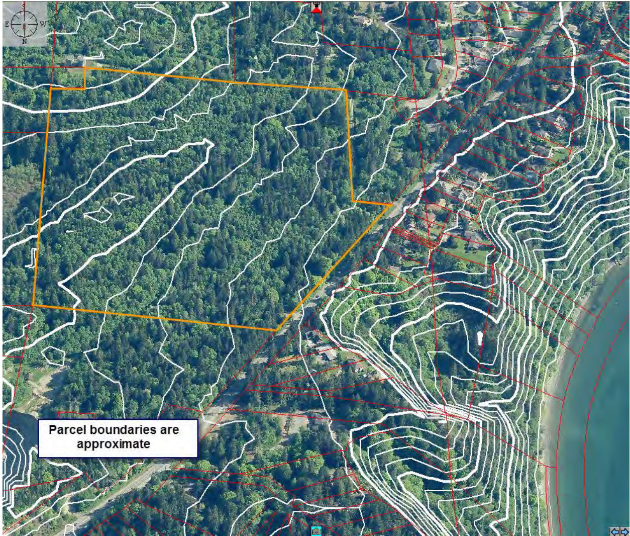
The body of water on the right-hand side of the above image is Burrows Bay. The main road running through the image is Rosario Road. The Wooding parcel is outlined with the orange line.