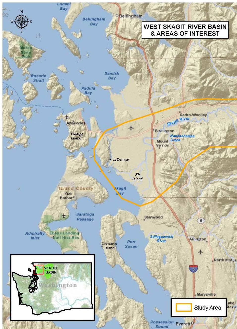
Figure 2. Lower Skagit River Basin and Areas of Interest