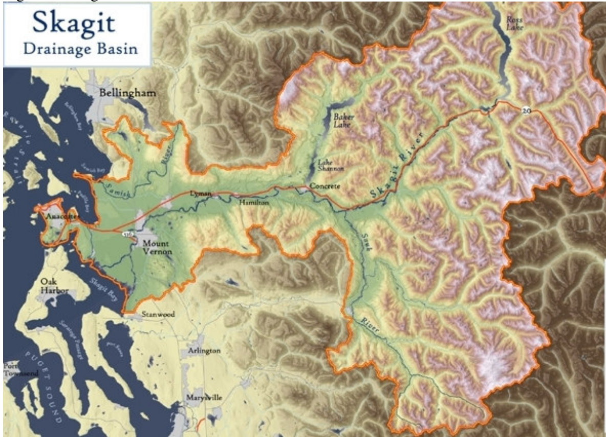
Figure 1. Skagit River Basin

(Pacific Coast Watershed Partnership, 2008)