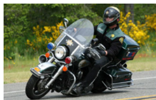
Motors and Traffic