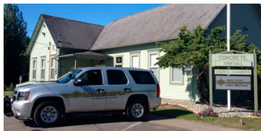
Back Country Patrol / East Detachment