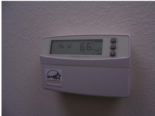
Main thermostat was for unoccupied SAR building was set at 66 degrees. County set point for unoccupied space is 55 degrees (see chart to the right).