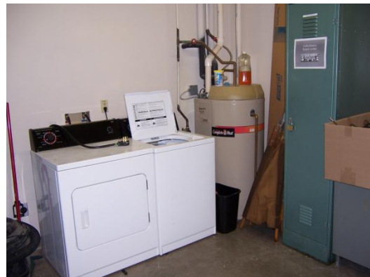
Lennox 'Complete Heat' hot water system is not working.

The systems are not working as intended nor synchronized well with the thermostats. They may need to be replaced. This will not be cheap to fix, but can be done with no cash outlay with an Energy Saving Performance Contract through the State General Administration Office. The County has agreed to work with McKinstry, first for a 'performance grade' audit of several facilities, and then to implement agreed upon projects. The contractor will be paid by a State loan to the County and the loan is paid back from monthly savings on utility costs, primarily energy.