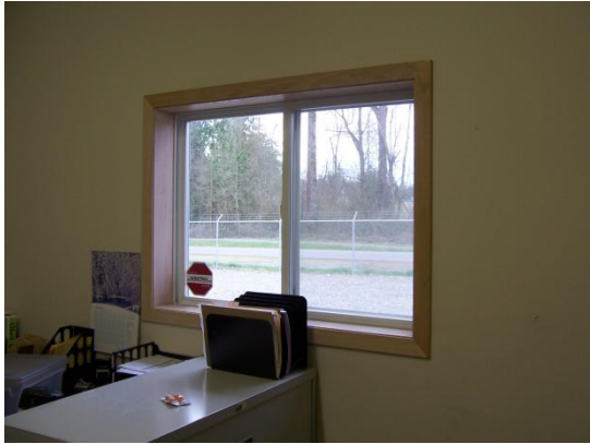
West-facing office window with no window coverings.

6. Add shades to the shade-less west and south facing windows.