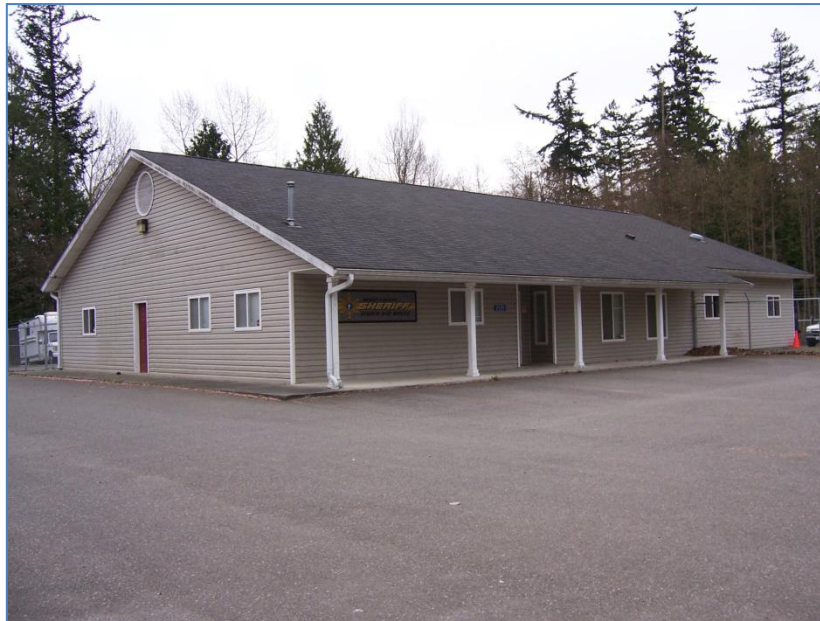
Skagit County Sheriff's Office Search and Rescue (SAR) Building