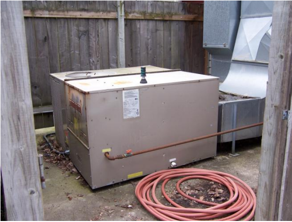
Goodman Gas-Pack provides heating & cooling.