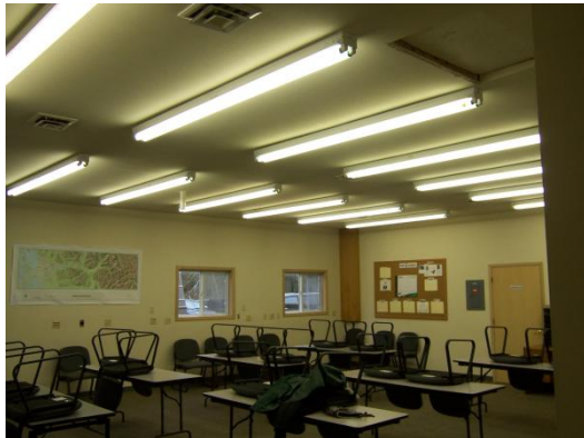
Array of 8', 2-lamp T-12 fixtures in Training Room.

Funding: Operating budget / Capital budget