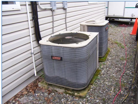
Lennox split system AC provides and heating via air handlers in attic with hot water coil heat.